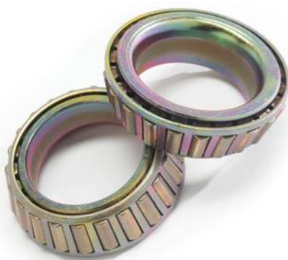
Electrodeposited coatings can offer tougher protection against water.