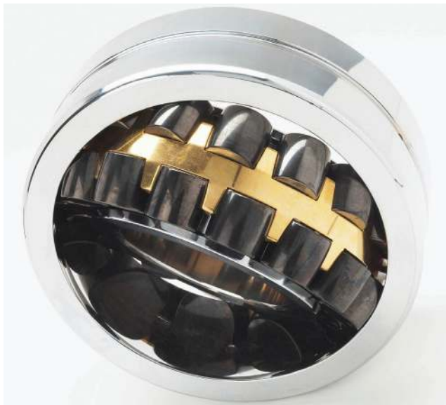
A spherical roller bearing with a PVD coating for extreme wear resistance.

Physical vapour deposition (PVD) is a vacuum deposition method used to produce thin films.