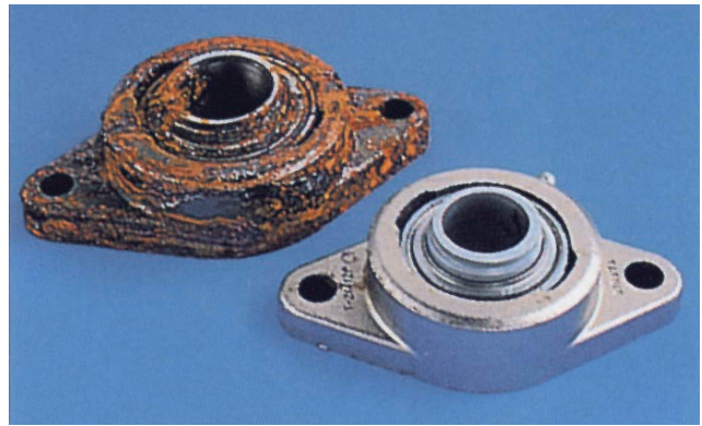
A housed unit with a protective spray coating vs. an uncoated bearing

Thin Dense Chrome (TDC) bearings are another type of roller bearing with an electrodeposited coating. These feature a thin, hard, chrome-based barrier that is designed to protect the bearing from rust and etching corrosion. Commonly applied in wet-end paper mills, food and beverage processing, and maritime applications, these bearings offer strong corrosion protection in cement plants where water poses special concern.