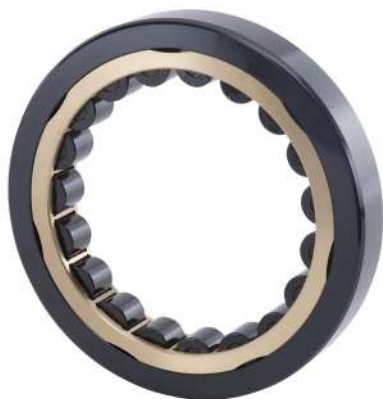
A black oxidation surface treatment can promote longer bearing life in heavy-duty applications.

PVD uses physical processes (such as heating or sputtering) to produce a vapour of material, which is then deposited on the object that requires coating. PVD coatings are deposited at temperatures between 150 – 160°C and are designed to operate at temperatures up to 220°C.